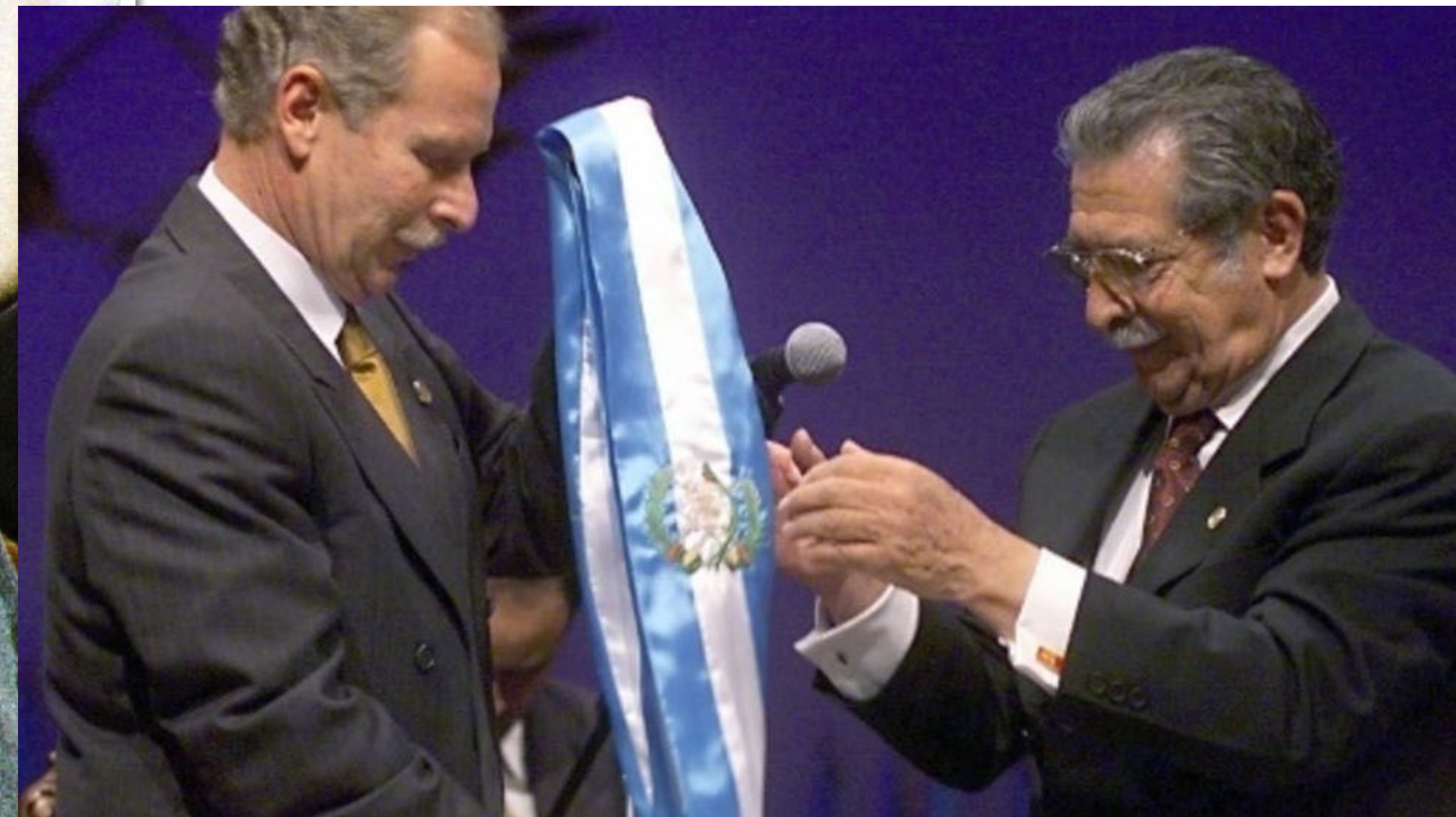
Patricio Aylwin, right, with Gen. Augusto Pinochet in Santiago, Chile, in 1993.